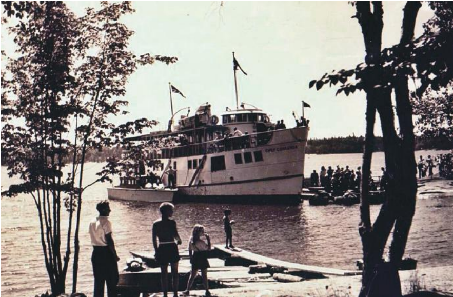
The old Chief at Keystone Lodge in the early 60's