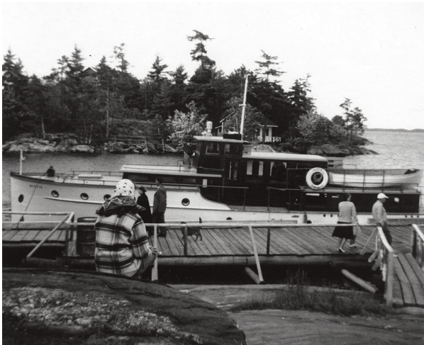
Left: 1951 Aletis fare and schedule and below the Aletis docked at Keystone.