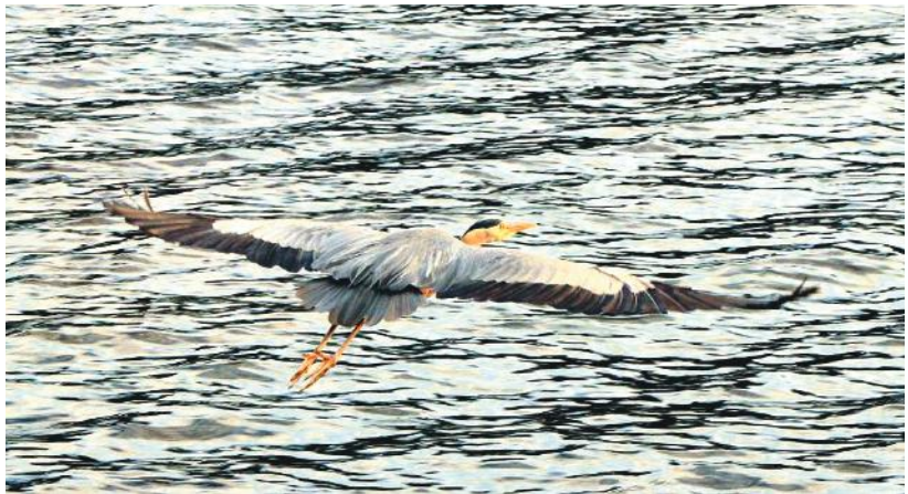
Gale Hamilton's photo took 2nd place in the 2016 Nature Category

graphs for the photo contest is rapidly approaching (April 15). Please send in your entries as soon as possible. Remember, we need high resolution pictures, and note that any one photographer can enter only 3 photos. But of course there are many "photographers" at every cot-