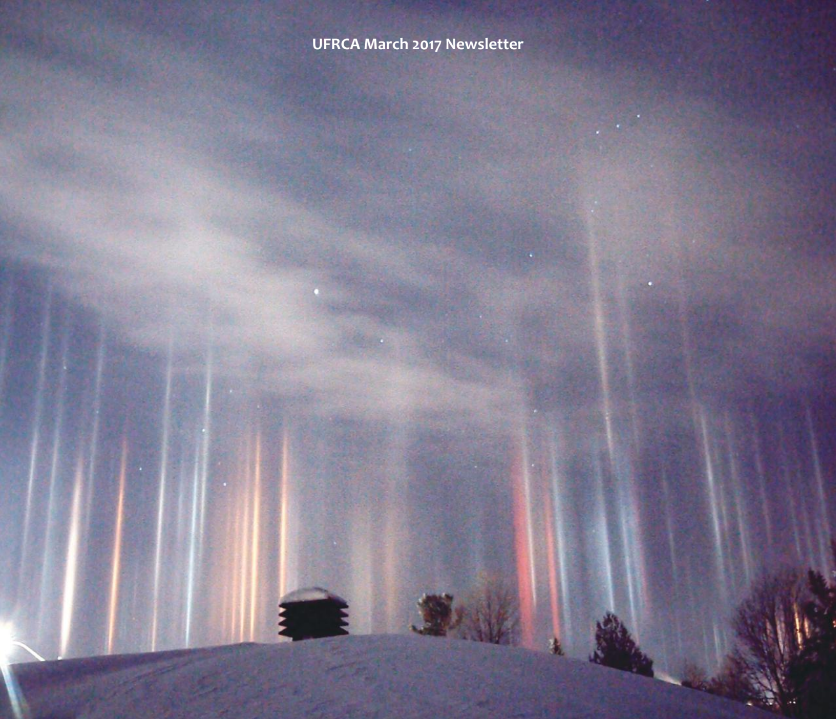
Beautiful winter photography of light pillars captured by North Bay photographer Timothy Joseph Elzinga