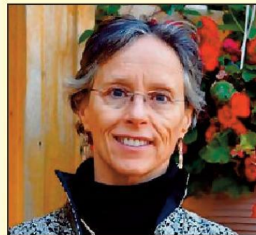
Commissioner Dianne Saxe

YOU ARE INVITED TO JOIN THE Environmental Commissioner of Ontario, Dianne Saxe, for a webinar on October 27, 2016 for high