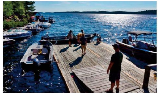
Solid Comfort crew greets UFRCA members arriving for AGM